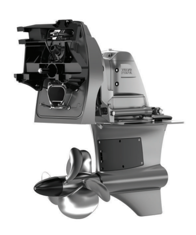
Available with Forward Drive